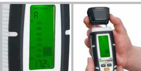
Stort oplyst display